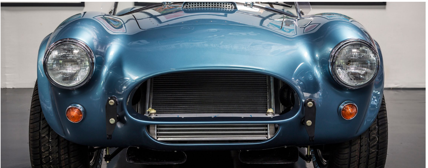
FIA cars feature brake ducts and optional oil coolers.

Fully independent suspension front and rear featuring transverse leaf springs.