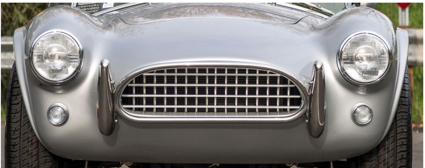
Slab Side cars feature front grilles with full hoop bumpers.