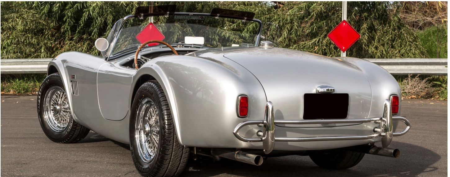
Slabside's feature straight cut fenders, where as the FIA features rolled fenders.