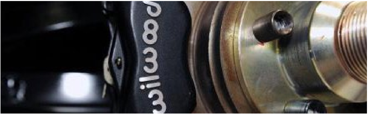
Wilwood racing brakes.

Fully independent suspension front and rear featuring transverse leaf springs.