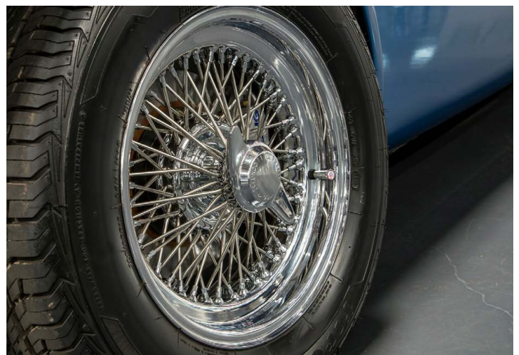
FIA wheels are traditional Halibrand style where as Slabside's feature a dayton wire wheel.